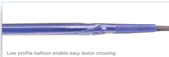
Low profile balloon enable easy lesion crossing.

Fast Track Dilation PTCA Balloon Catheters are designed with a low entry profile of 0.017" and a unique distal shaft that enable easy lesion crossing during pre-dilation and for total chronic occlusion interventions. The customised inner lumen minimises friction without compromising stiffness. The unique hypotube design ensures excellent pushability and trackability.