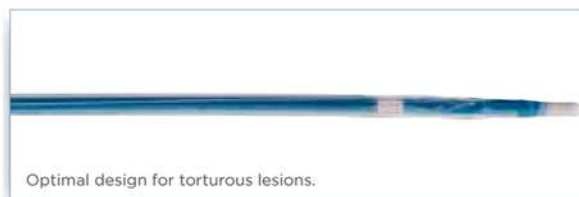
Optimal design for torturous lesions.

The feature of Vas Track gives it an added advantage as stent delivery catheter. The high pressure, low complaint balloon material facilitates the optimal crimp and predictable deployment of stents. The less complaint nature of the balloon allows uniform expansion of stent with the balloon.